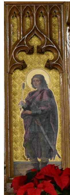
St. Edmund king of East Anglia, who was patron saint of England before St. George.

Georgia, Lithuania, Palestine, Portugal, Germany, Greece, Russia, Istanbul, Ethiopia, Serbia, Croatia, Bosnia, Montenegro, as well as a lot of cities, e.g. Barcelona, Aragon, Catalonia, Genoa, and Venice (after St. Mark). He is also patron saint of Scouts. I suspect that there are a lot more - if you know, please let me know!