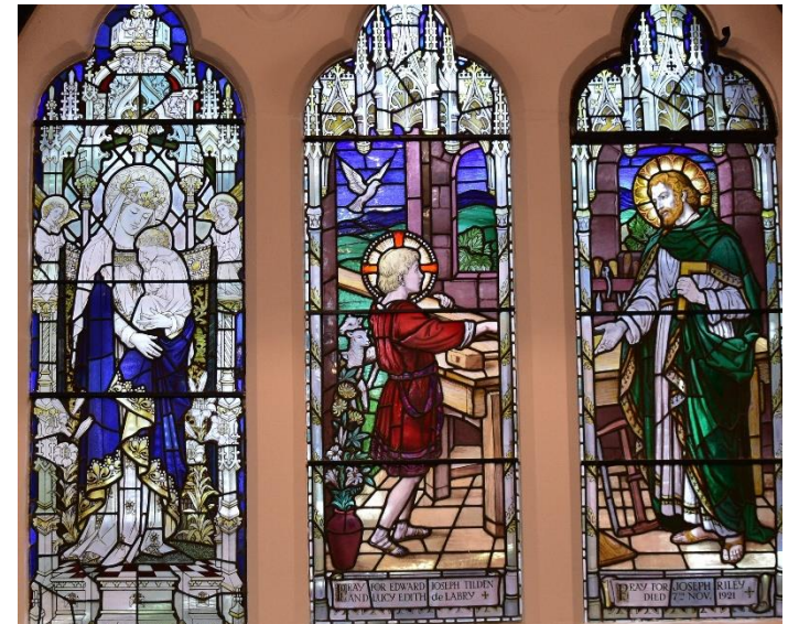
Holy Family window in St. Joseph's Malvern

18 th March: St. Joseph, patron of a happy death, pray for us